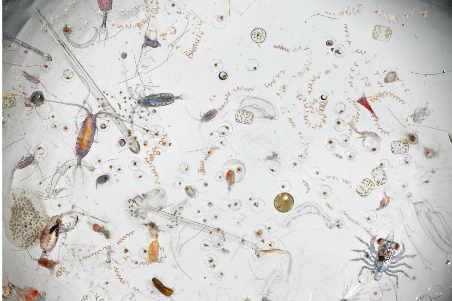
A DROP OF CONCENTRATED SEA WATER